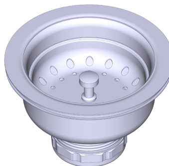
Basket Strainer Assembly, 3-1/2"