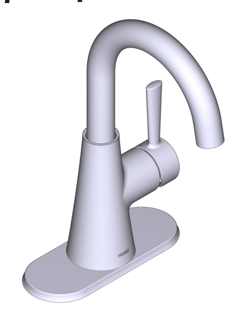
Ronan<sup>™</sup> One-Handle Lavatory Faucet