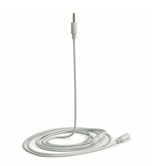
Moen Smart Leak Detector 6' Leak Sensing Cable