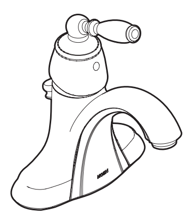
LINDLEY™ Single-Handle Lavatory Faucet with Plastic Waste Assembly