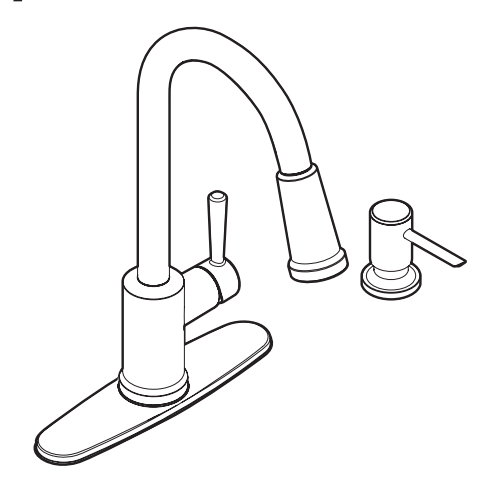
INDI™ Single-Handle High Arc Pulldown Kitchen Faucet