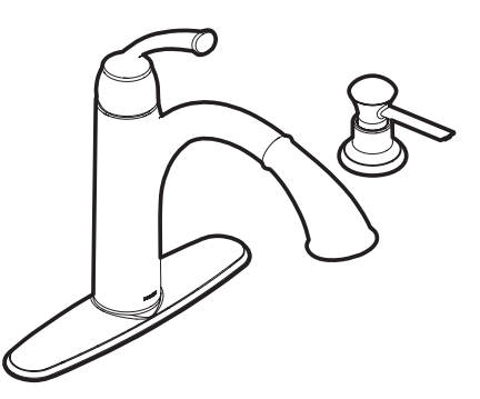
Sullivan™ Single Handle Pullout Kitchen Faucet