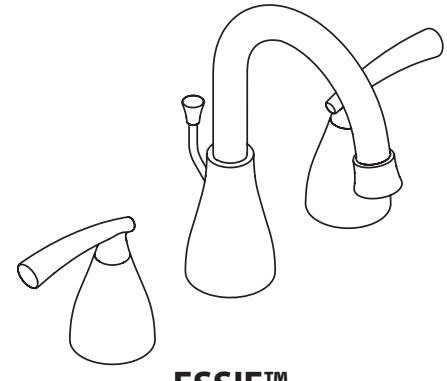
ESSIE™ Two-Handle Widespread Lavatory Faucet