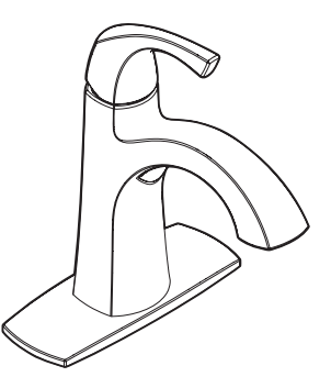
Lindor™ One-Handle Lavatory Faucet