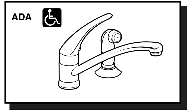
MONTICELLO® Single-Handle Kitchen Faucet with Protégé Side Spray