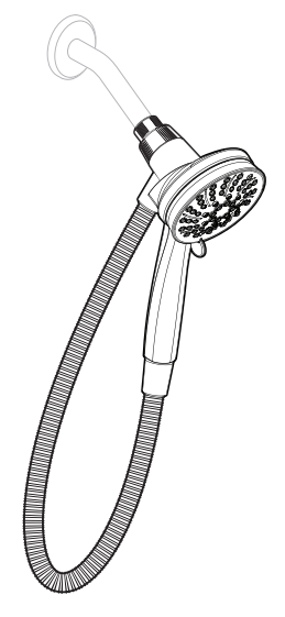
Attract™ 6-Function Handshower with Magnetix™ Docking and Hose