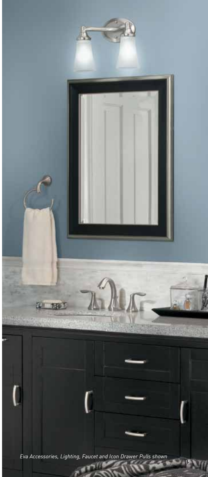
Eva Accessories, Lighting, Faucet and Icon Drawer Pulls shown

It's a classic design that will enhance any bath. The Mason® collection's rounded design is extroverted without being showy, substantial without being overbearing, bold without being brash. Matches Moen® Chateau® faucets.