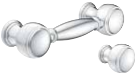
Weymouth® Knobs and Pulls

With our distinctive collection of knobs and pulls, you can create a perfectly matched bath or kitchen décor and carry your style throughout the room.