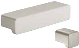
90°™ Knobs and Pulls