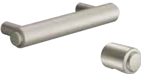
Iso™ Knobs and Pulls

Finish availability varies by SKU. Consult BA0400 for complete collection details.