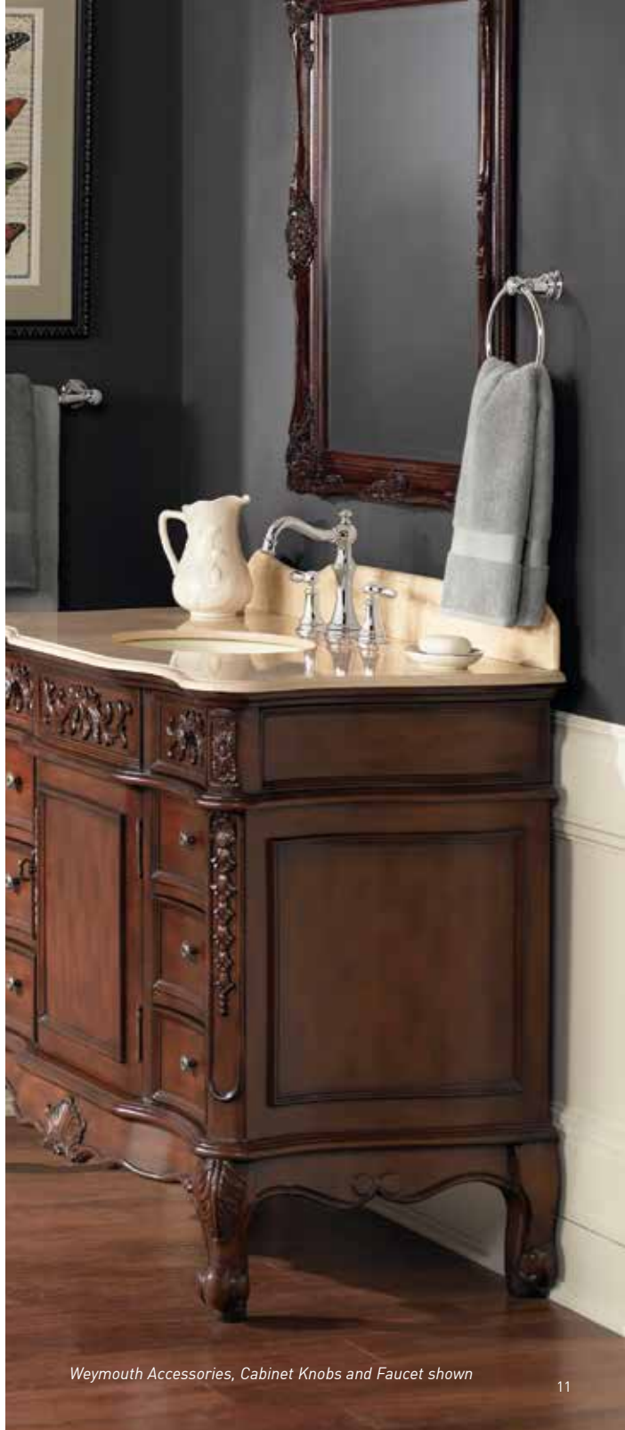
Weymouth Accessories, Cabinet Knobs and Faucet shown

Waterhill® accessories have a time-honored presence that gives your bath traditional charm.