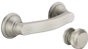
Rothbury™ Knobs and Pulls