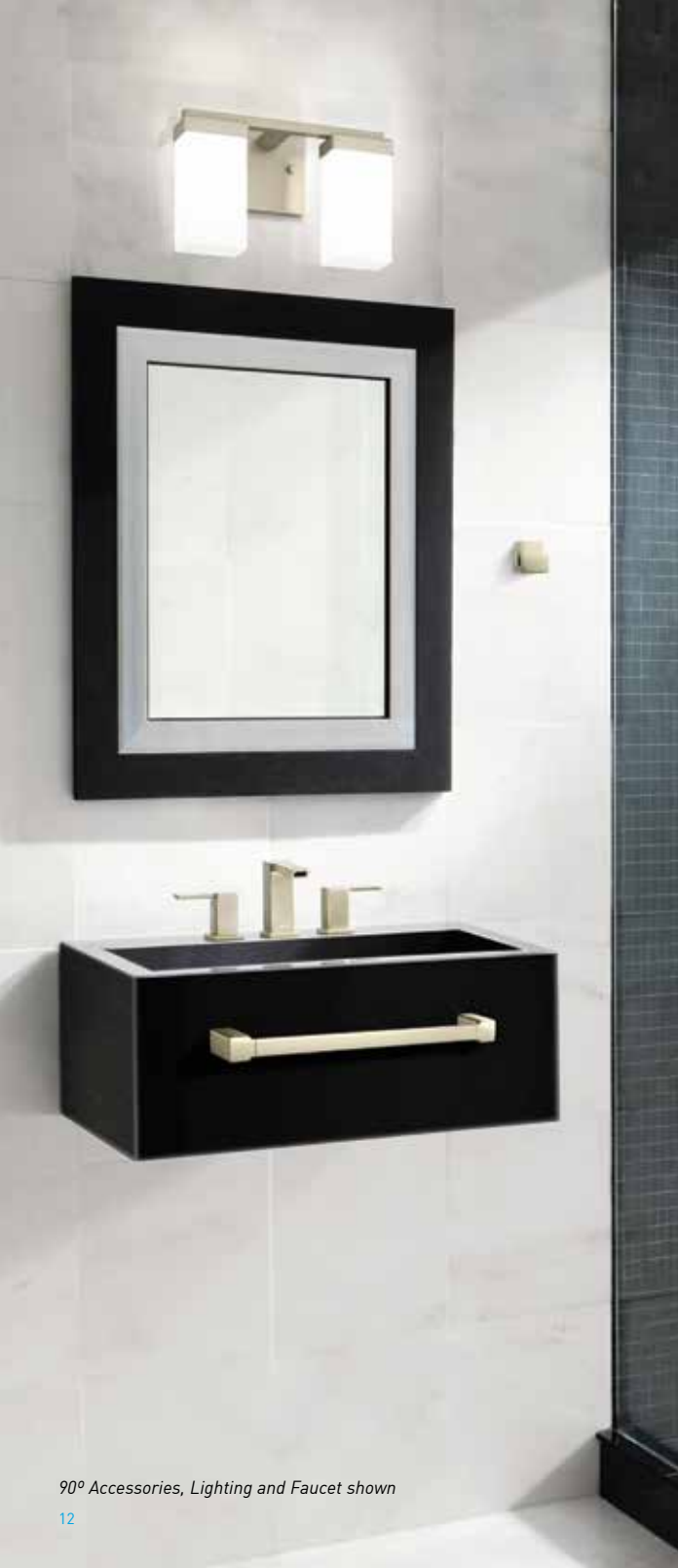
90° Accessories, Lighting and Faucet shown