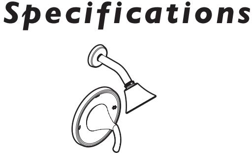
GLYDE<sup>™</sup> Single-Handle Tub/Shower Trim Kit

Models: T2741 series - valve trim only T2742 series - shower trim only T2743 series - tub/shower trim T62742 (bulk)